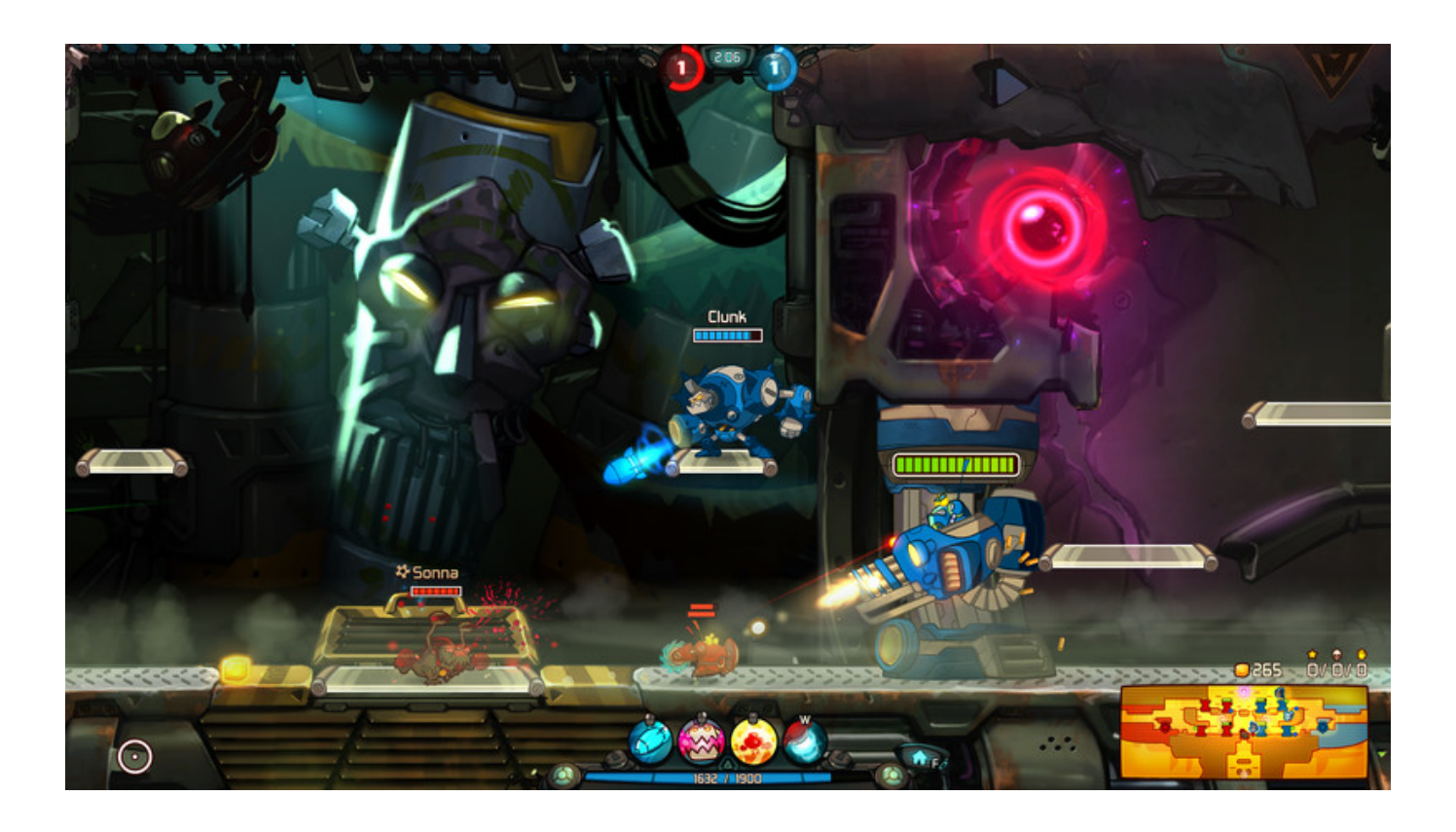
Clunk - Awesomenauts Character Activation Code Free